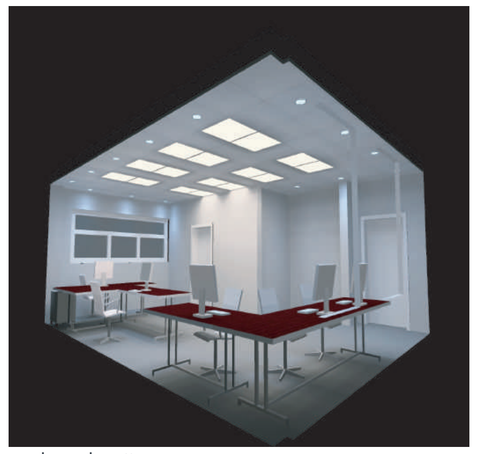
Studio Light office , Lagos