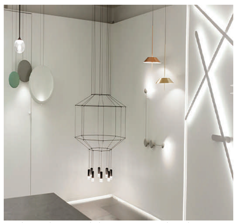
Display of decorative lighting fitting, random showroom.