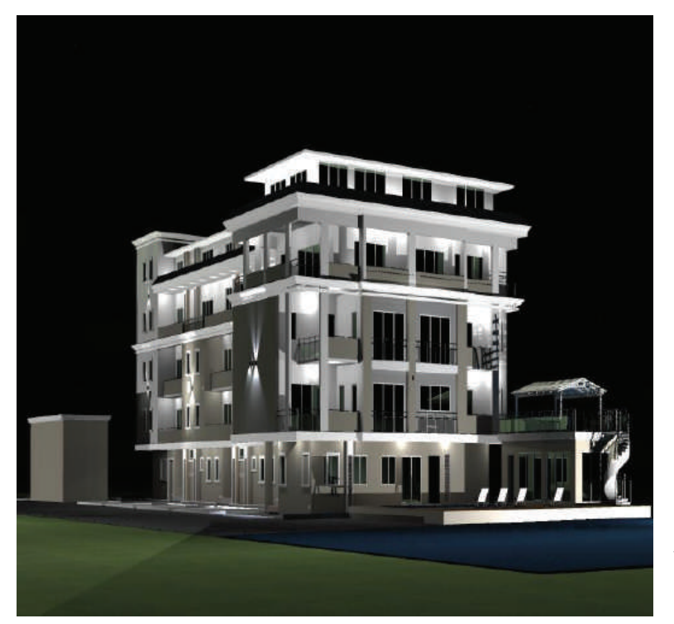
Private residential building, Banana Island, Lagos, Nigeria