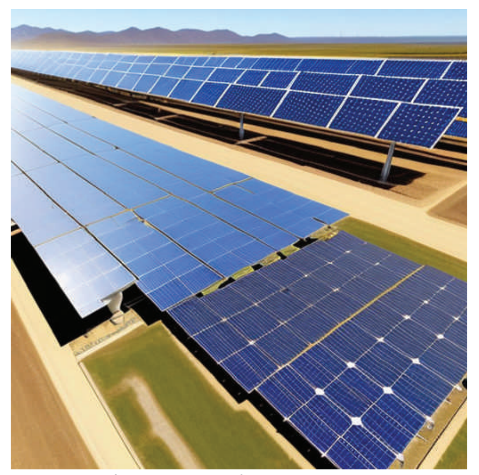
Al generated image for a solar farm