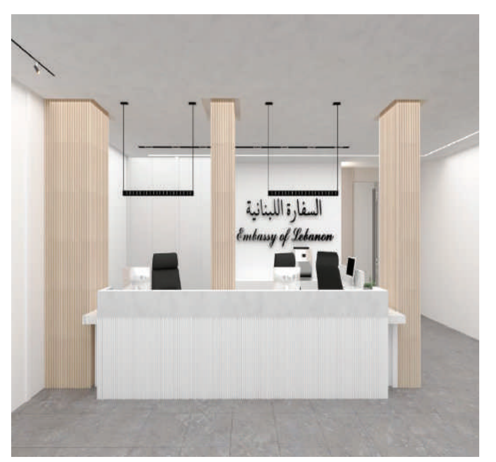
The Embassy of Lebanon, Abuja, Nigeria (MEP works)