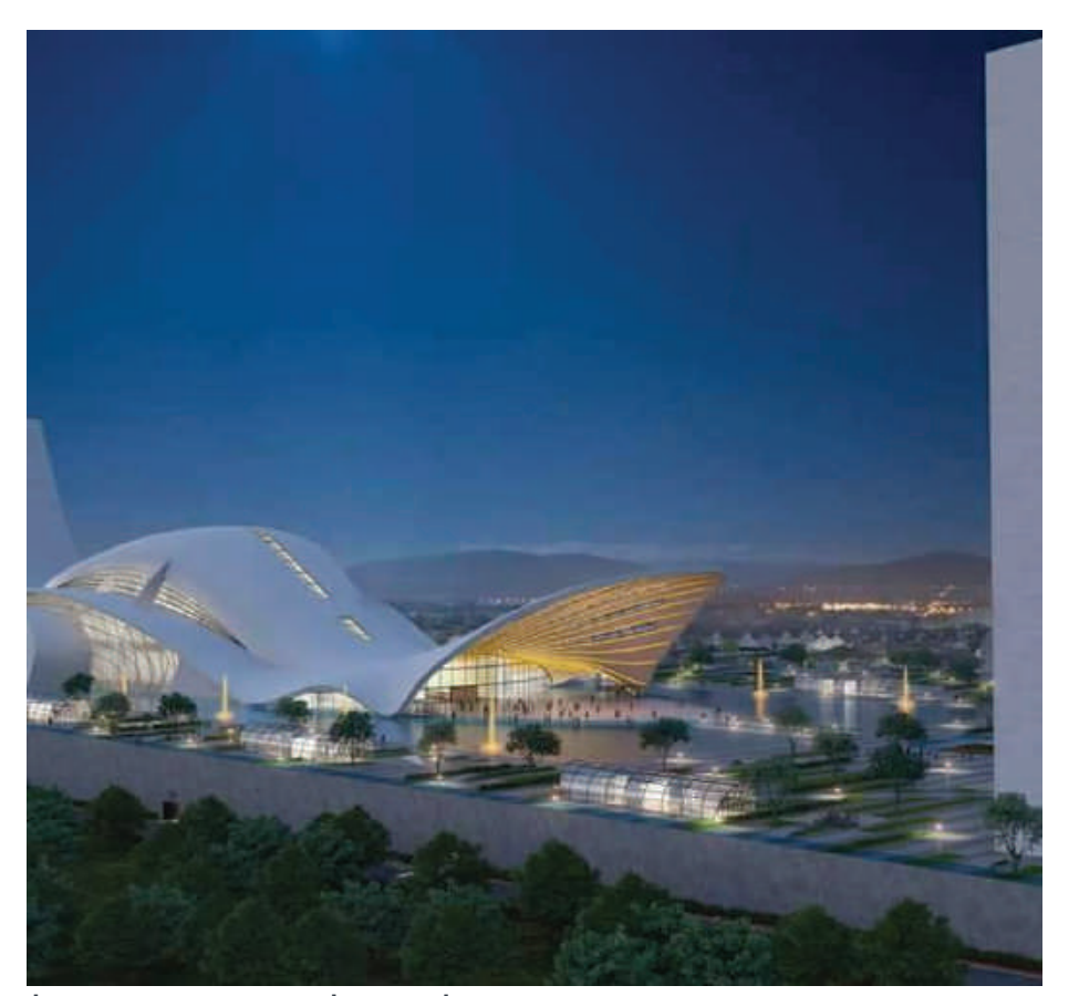
Ibom International Worship center, Nigeria