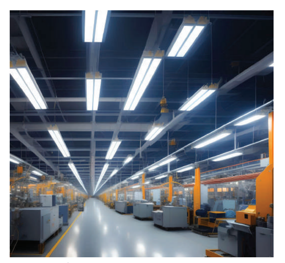
Al generated image for a LED factory