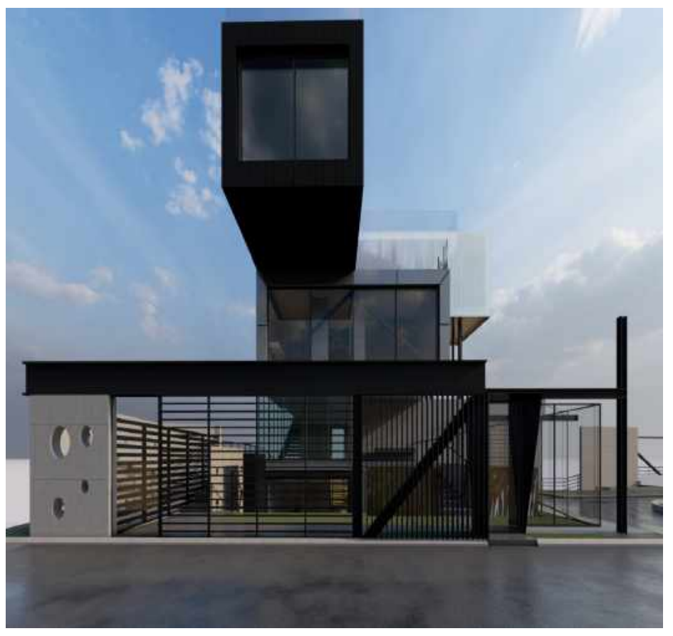
Private Residence, Adma, Lebanon

Lighting is the reason we favor one room in a house over another, why we're more comfortable in some offices than others and why we enjoy the experience of shopping in one store over another.